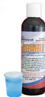
Acaril Laundry Additive For control of dustmite allergens